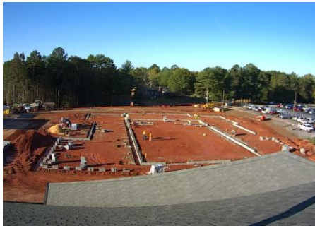
(Building Foundation – Oct 28)