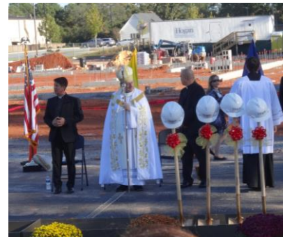
(Ground Breaking with Bishop – Oct 27)

Any problems experienced in the past month? (If yes, please explain)